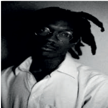
Mosiah N'Asad Creative Writing College of Arts and Sciences