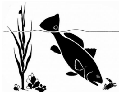
North Inlet-Winyah Bay National Estuarine Research Reserve